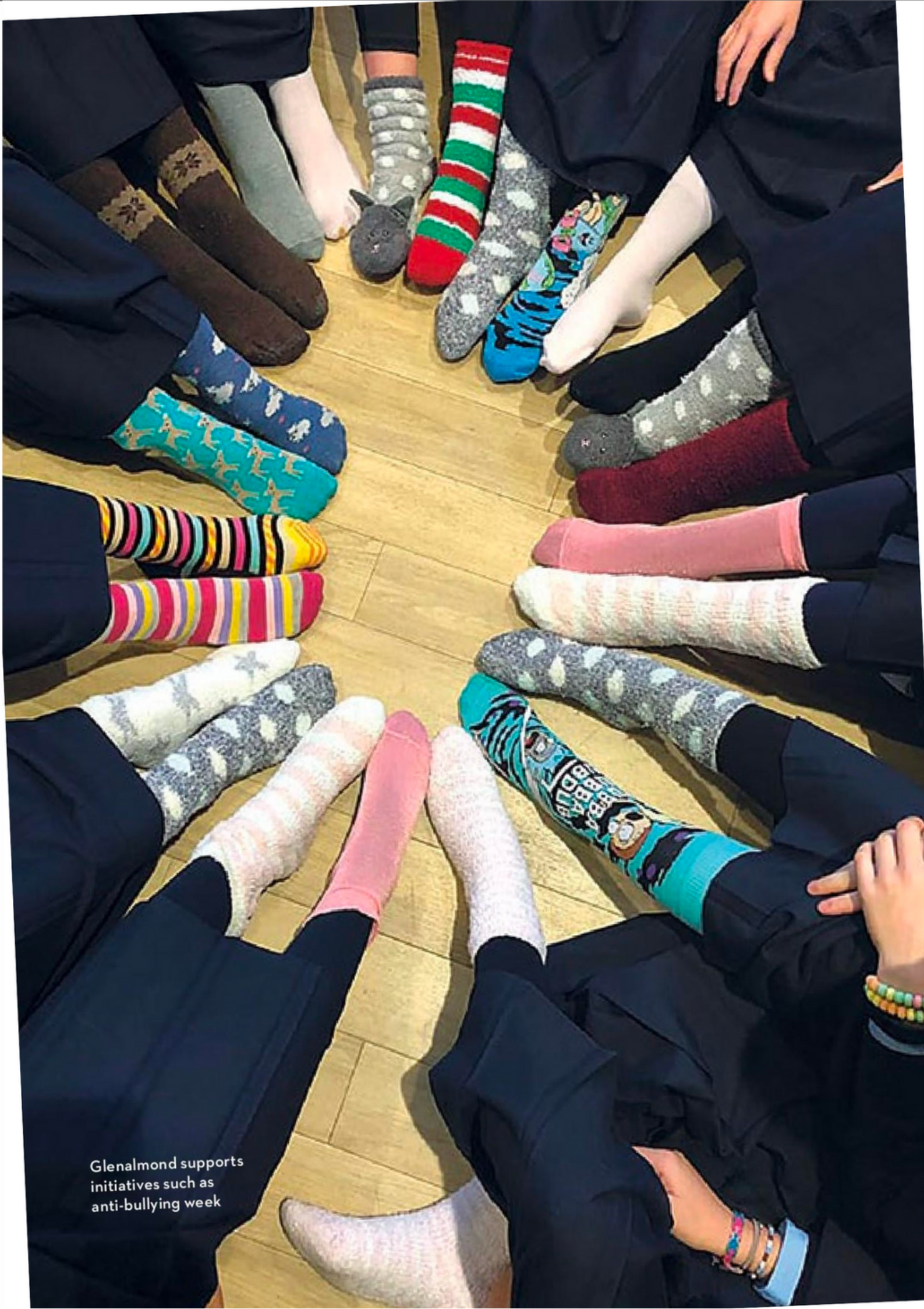
Glenalmond supports initiatives such as anti-bullying week